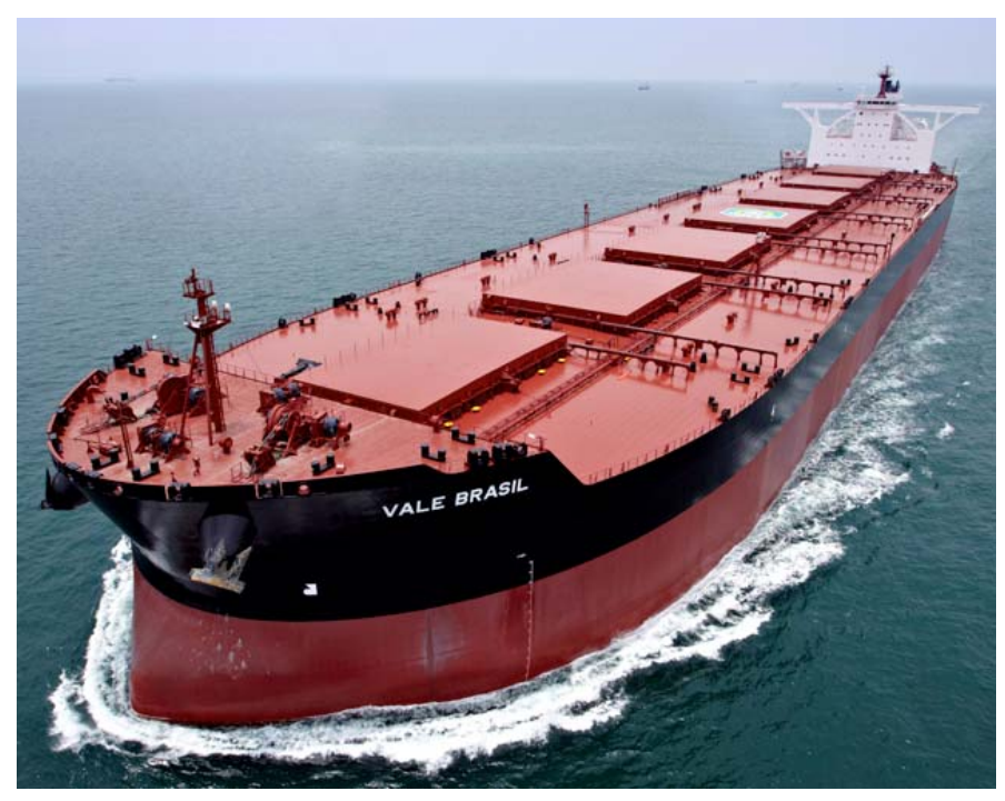
Bulk commodity ship

A new service for the Oakland waterfront